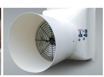
Made of durable fiberglass, AP's optional discharge cones boost fan output by as much as 15%. The 14"-36" fiberglass cones are provided as a onepiece unit and 50" & 54" in an easy to ship and assemble 3 or 4-piece units.